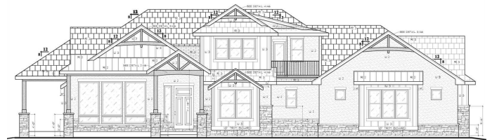
FRONT EXTERIOR ELEVATION